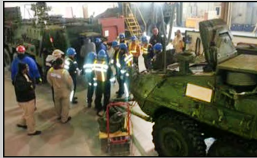
403rd Army Field Support Brigade's APS-4 receives first Strykers SPECIAL AFN REPORT FROM KOREA