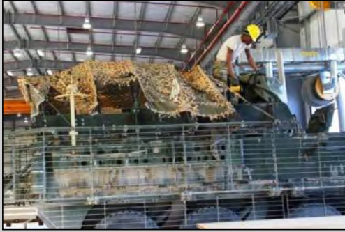
401st Army Field Support Brigade keeps retrograde on pace SPECIAL PENTAGON CHANNEL REPORT FROM AFGHANISTAN