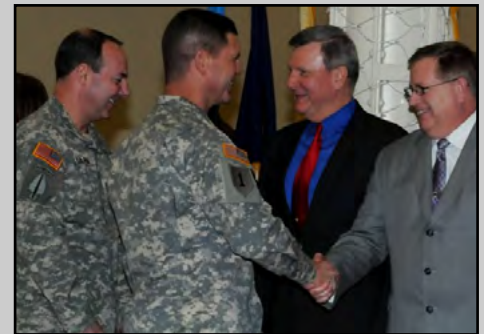
ASC recognizes employees for hard work, long service, productivity at quarterly awards ceremony