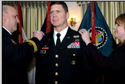
ASC's deputy commanding officer receives first star, new title