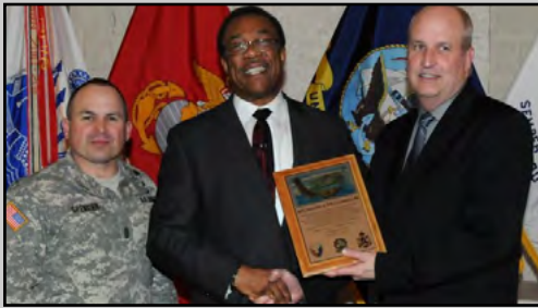
Rock Island Arsenal celebrates life, accomplishments of Dr. Martin Luther King Jr. at Island-wide celebration