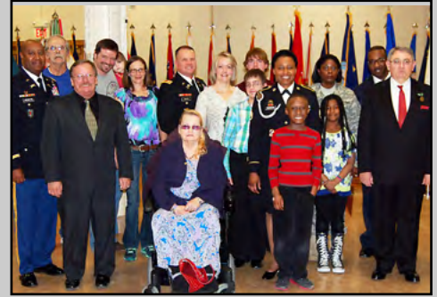
Five honored at quarterly Rock Island Arsenal Retirement and Retreat Ceremony